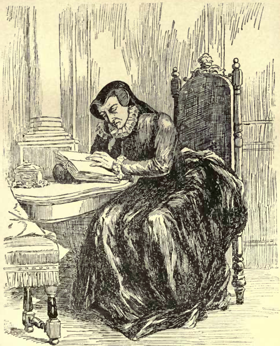
CATHERINE DE MEDICIS